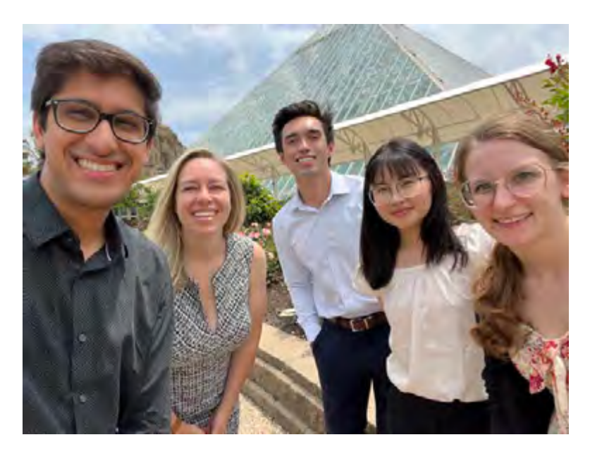
ALCALDE - April 2023

Animal shelters can always use supplies, especially warm blankies given with love. Our residents, with help from faculty, got together to make a few "no-sew" blankets for the Animal Defense League of San Antonio. Way to go!