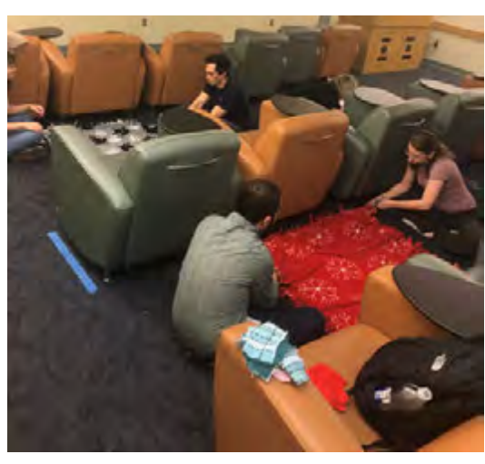
Blankets for Animals - December 2022

Animal shelters can always use supplies, especially warm blankies given with love. Our residents, with help from faculty, got together to make a few "no-sew" blankets for the Animal Defense League of San Antonio. Way to go!